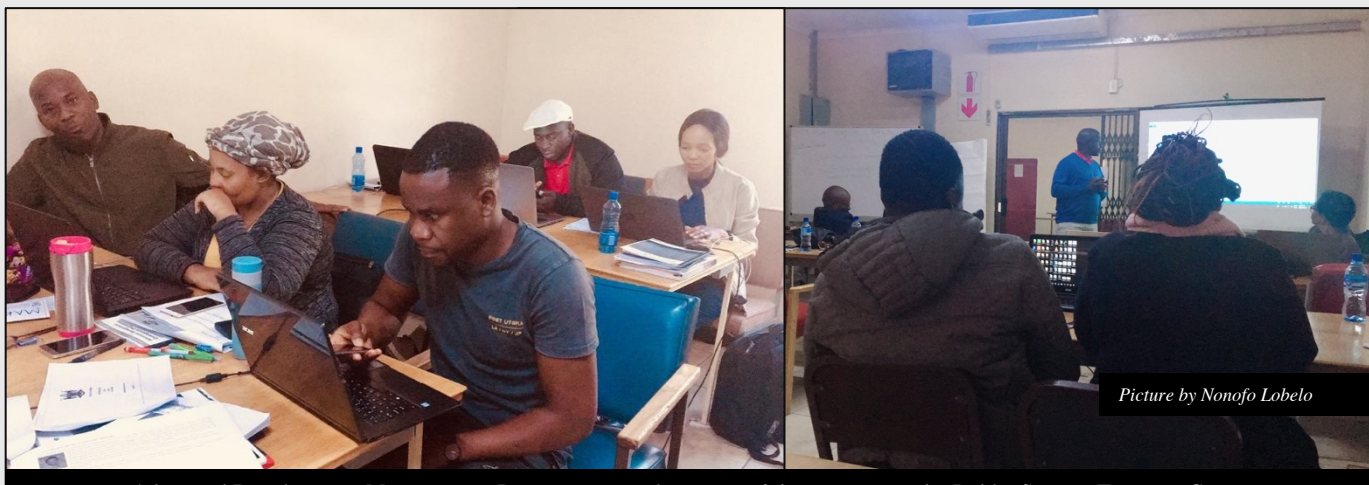
Advanced Development Management Programme intake in one of the sessions at the Public Service Training Centre