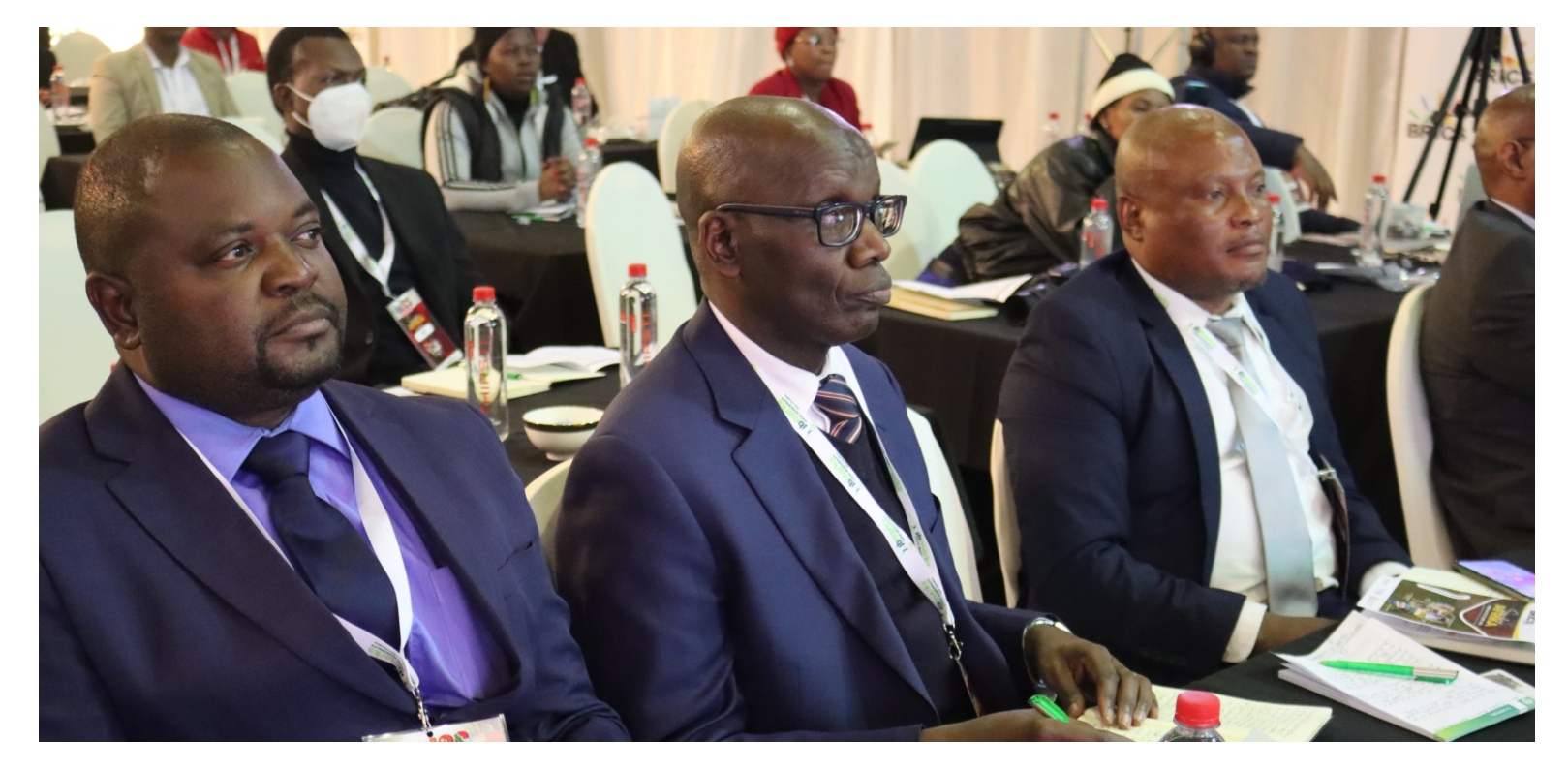
By Stanley Ndlovu

Addressing the BRICS summit recently at Potchefstroom, North West MEC for Economic Development, Environment, Conservation and Tourism, Galebekwe Tlhapi said that this engagement will enable African countries to have smooth intertrading processes amongst themselves to boost their economies and reduce the high rate of unemployment.